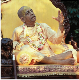
His Divine Grace Srila A.C. Bhaktivedanta Swami Prabhupada

Our society is commonly known as the Hare Krishna Movement (also known as ISKCON: International Society for Krishna Consciousness) and has its roots in ancient India, in the Vedas (oldest sacred scriptures of India), and in the saints and sages of Vaishnavism dating back more than five thousand years. So we are certainly not a new or modern religious group; we are following the deep ancients and the primeval scriptures, which are still relevant in this modern world. We want to share with you this ancient knowledge, from the manuals of mankind, that reveal the innermost secrets to spiritual awakening.