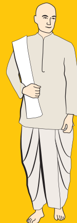
KURTA AND DHOTI

God is one but takes on different forms when He descends to Earth. The Vedic scriptures describe different incarnations of God who come in different forms for various purposes. His birth and activities in this world are otherworldly and not bound by material constraints.